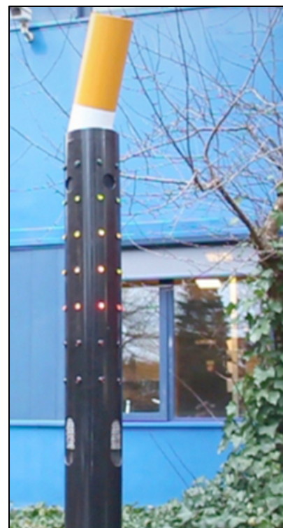
The enticing Fumo smoke pole ash receptacle from loglo, The Netherlands, performs a light show, a tune or funny side effect to reward smokers who use it for depositing their cigarette ends. List price: approximately $20,000.

With so many smokers littering cigarette butts from cars we would like to see automakers start building ashtrays into their vehicle designs as a standard feature again like they once did.