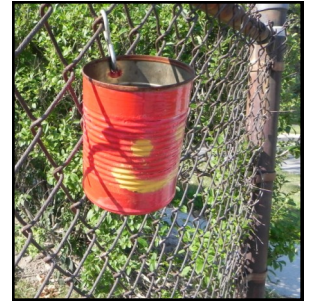
Above, a handmade butt can tied to a fence.

A Litterland reader recently commented that smokers litter butts profusely with very little push back. Starting the habit of smoking is so routinely discouraged that no instructions for use or directions for disposal appear on the package to teach the smoker to use a bin and not to throw product remnants on the ground. People need to speak up to smoking friends and family members to inspire right action and ask industry and governments to do more.